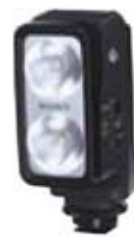
HVL-20DW2 10 watt & 20 watt Dual Video Light