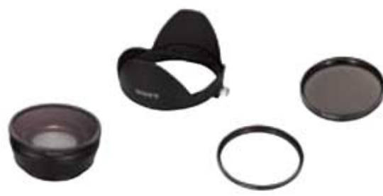
VCL-HG0872 72mm 0.7x Wide Angle Lens and Lens Hood