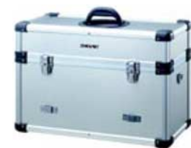
LCH-FXA Professional Handycam™ Carrying Case