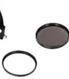
VF-72CPK 72mm Polarizing Filter Kit